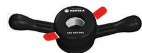
HAWEKA Quick Nut (only Bella D)

Follow us by your smart device www.boltech.it